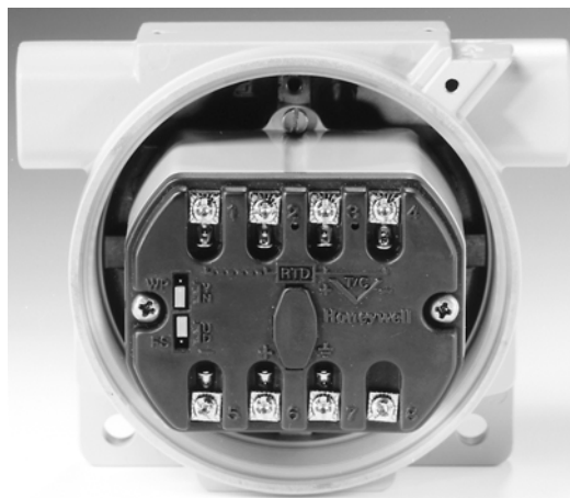
Figure 1 – STT350 Transmitter in field mount housing. The Model STT35F is identical in size but details vary.

For the STT35F, the output conforms to the low speed (H1) of the Fieldbus Physical Layer specification IEC 1158-2 (1993). The other protocol layers conform to the FOUNDATION ™ Fieldbus which is supported by all the worldwide instrumentation suppliers and enables multidrop field instruments to be powered down a single wire pair and communicate measurement, control, configuration and diagnostic data at 31.25kbps.