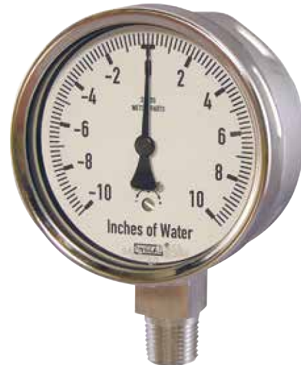
Capsule Element Pressure Gauge Model 632.50

Additional error when temperature changes from reference temperature of 68°F (20°C) ±0.6% of span for every 18°F (10°K) rising or falling.